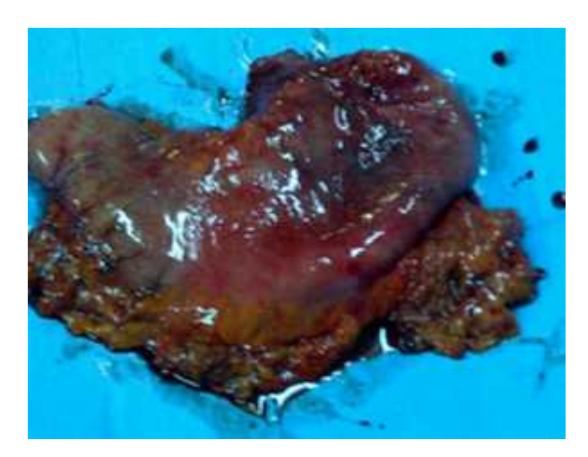
Figure 1: Resected segment of ileum and colon

intussusception. There was minimal peritoneal soilage and about 50 millilitres of sero-fibrinous peritoneal fluid was drained. He had resection of both intussusceptions (Figure 1) and intervening devitalized bowel with an end to end primary ileo-sigmoid anastomosis.